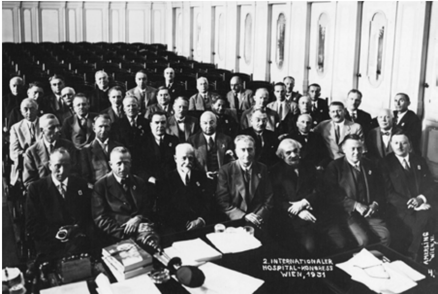
From the second International Hospital Congress in Vienna 1931 (Danish Museum of Nursing History)