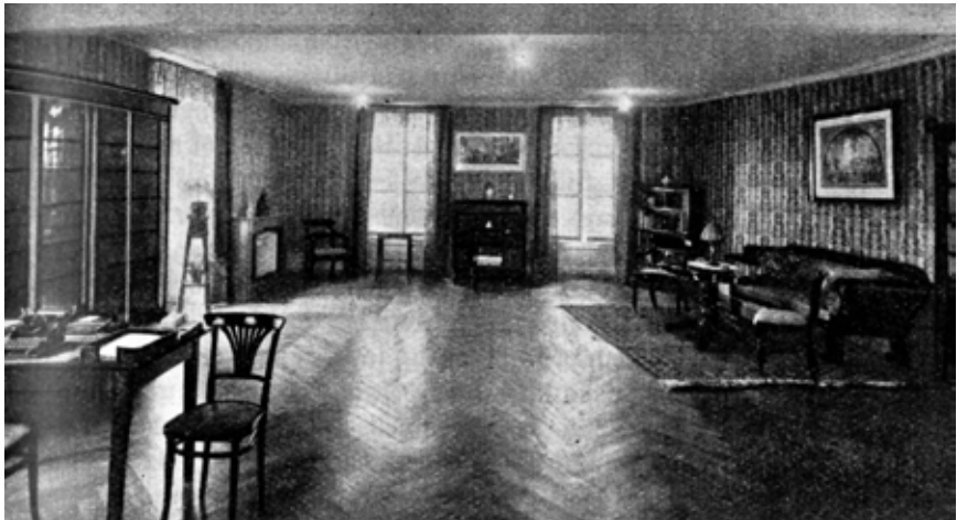
ICN Head quarters in Geneva 1926: The conference room (Danish Journal of Nursing 1926)